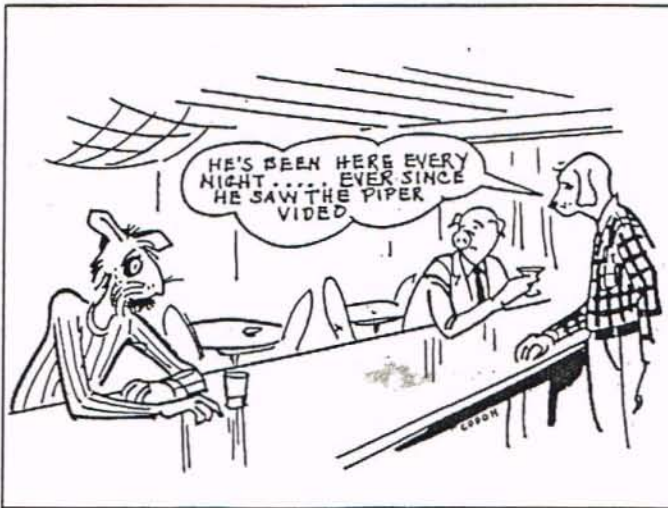
Spiegelmaus reflecting on the success of revisionist campaign at University of Texas